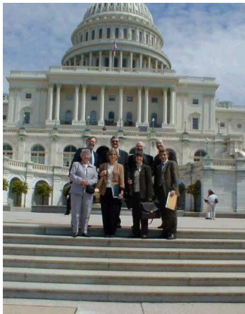
GADFA members gather outside the capitol.

Three local papers wrote stories about the Gettysburg Area DFA's day-long lobbying trip to DC on April 14 to discuss Social Security.