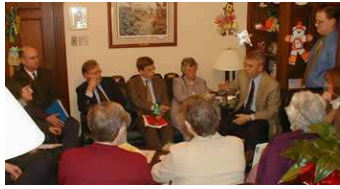
GADFA members meet with Rep. Todd Platts.